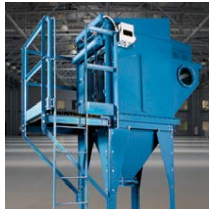
Vertical Cartridge PleatJet™ CF