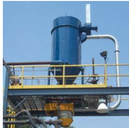
Side Bag Removal Cylindrical CBR