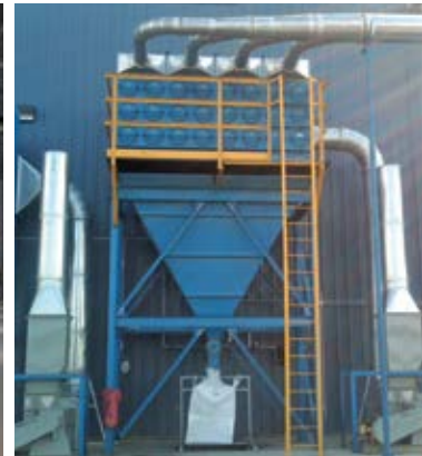
Horizontal Cartridge PleatJet™ II Plus HCF