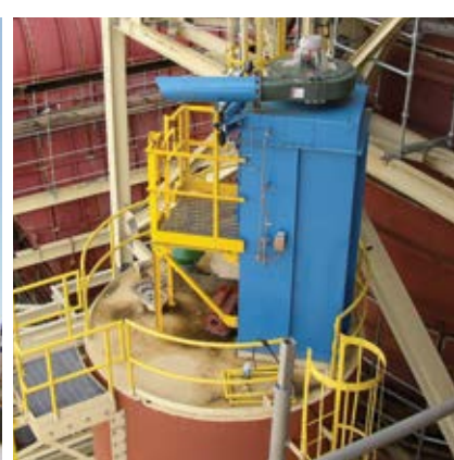
Side Bag Removal Rectangular SBR